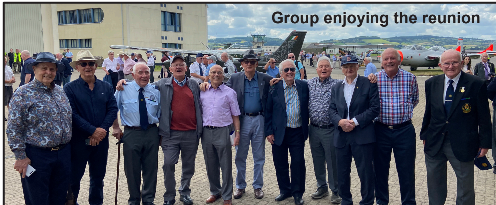
Group enjoying the reunion

During the day some aircraft arrived which were due to participate in the Bray Air Show over the following weekend including two aircraft from the UK Battle of Britain Flight, the Lancaster Bomber and a Hawker Hurricane. These aircraft were escorted to Baldonnel by a flight of 4 x PC9 Air Corps Aircraft.