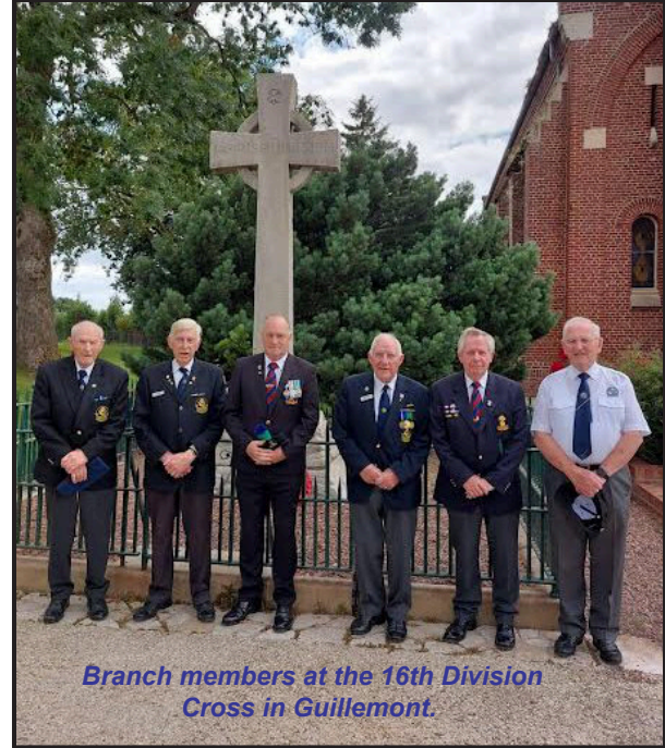
Branch members at the 16th Division Cross in Guillemont.