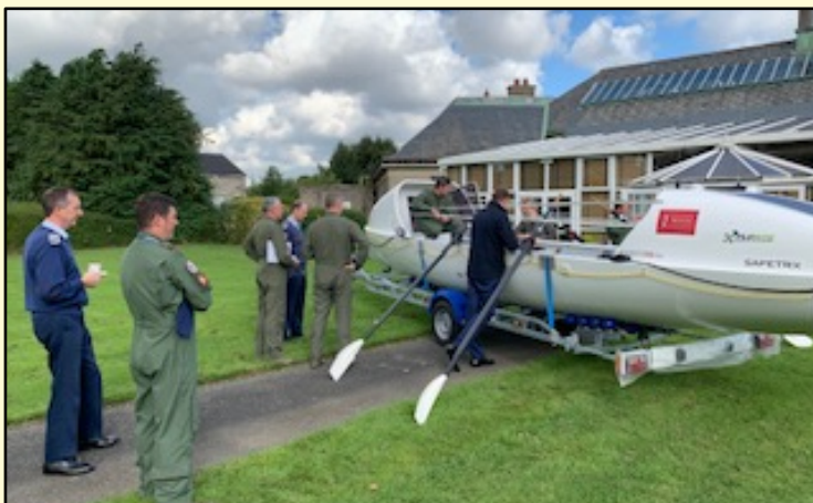
Boat arriving in Baldonnel