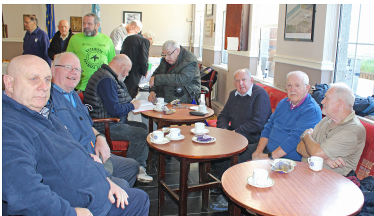
Old comrades meet up