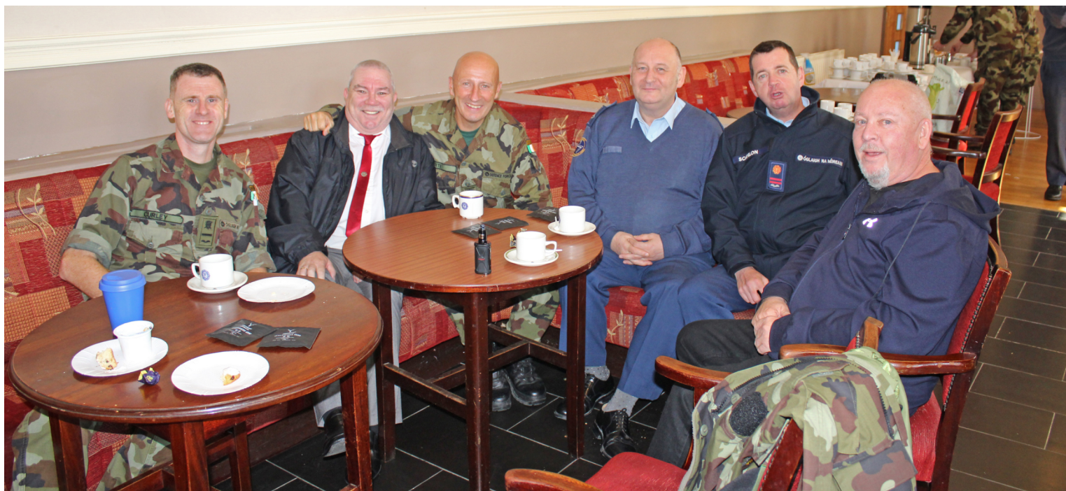
Serving Members also support the event.

CUIMHNIMIS Let us remember those who have died.