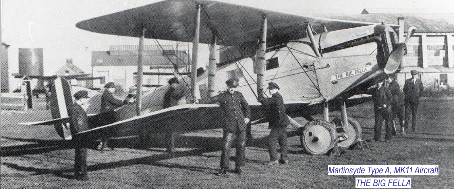
Martinsyde Type A, MK11 Aircraft THE BIG FELLA