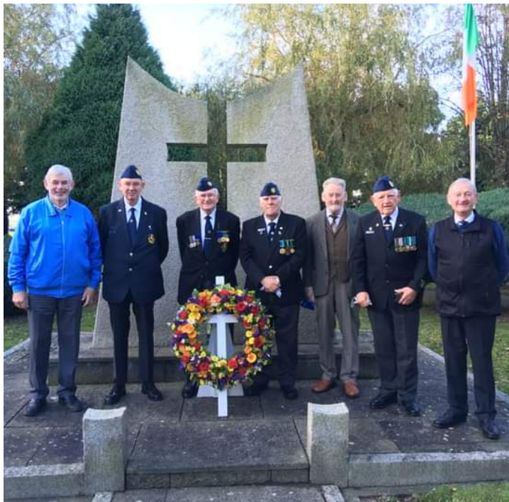
Branch Members attended the Annual Air Corps Mass for Deceased members in Casement Aerodrome on 2/11/2021.