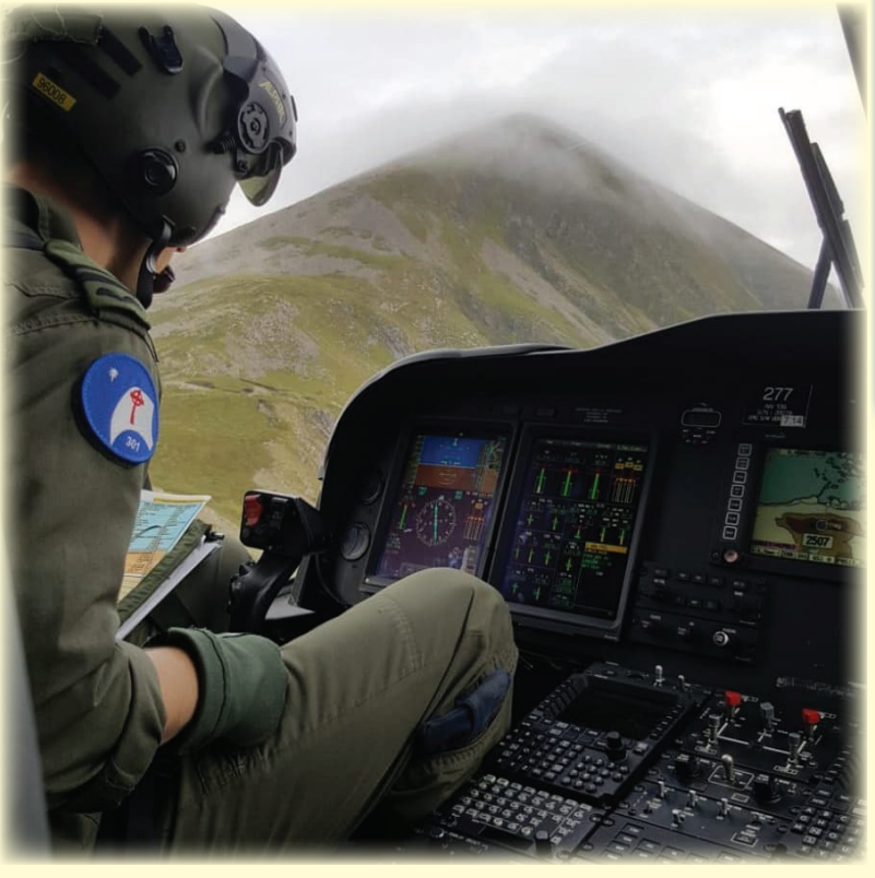
An AW 139 helicopter crew performed an Air Ambulance role on Croagh Patrick on Reek Saturday and Sunday transporting injured patients to safety and to Castlebar Hospital.

What can we do with a day and a half? In the past 36 hours the Air Corps has completed 3 Air Ambulance missions and 2 dedicated Mountain Rescue Missions for cardiac and trauma patients, five of these were completed by No.3 Operations with some of our AW139 Helicopters. While our Casa Aircraft transferred a patient from Cork to the UK for specialist Care. All our Crews will be ready to do it again tomorrow. The Air Corps also took part in the spectacular Bray Air Show.