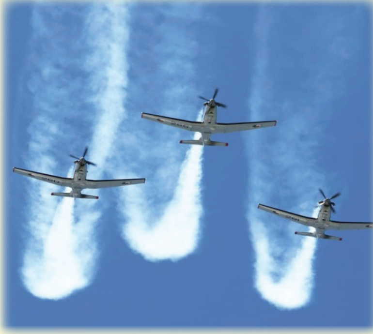
Spectacular PC9 Formation