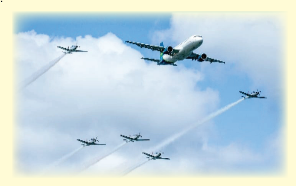
An Aer Lingus A320 aircraft flying in formation with 5 Air Corps PC9's

Some spectacular pictures of Air Corps Aircraft performing at the Air Show: