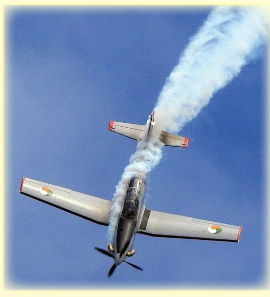
Unusual Smoke pattern from the PC9.