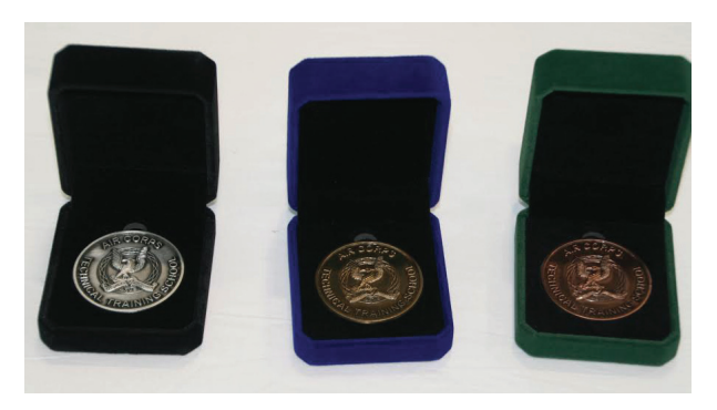
Gold, Silver and Bronze medallions awarded to the top apprentices

We wish all the apprentices every success in their future careers.