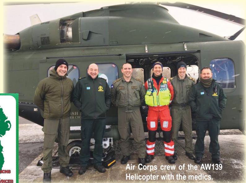
Air Corps crew of the AW139 Helicopter with the medics.

Today was a very special day for the Irish Air Corps as it welcomed 5 new members to the Officer Corps during a commissioning ceremony at Casement Airbase.