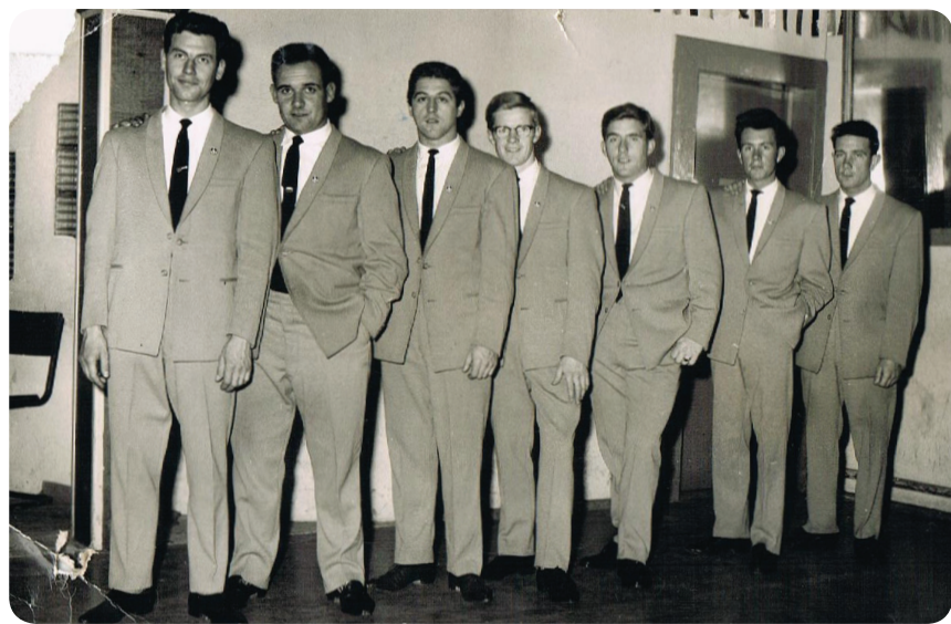
Picture taken Mayfair Ballroom Clondalkin. 1961