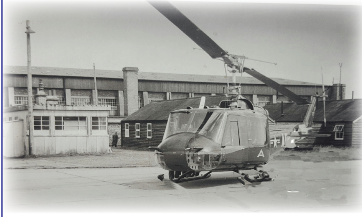
A US Army UH-1 Iroquois (HUEY) Helicopter was based in Baldonnell during former US President Eisenhower's visit to Ireland in 1962.

Contrast the differences in character and background between both these great leaders. Eisenhower a former five star General and Supreme