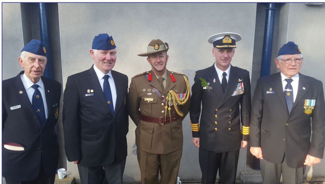
A number of Branch members attended the ANZAC Dawn Service which was held in Grangegorman Cemetery on April 25th at 0630 hrs.