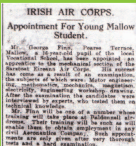
FROM CORK EXAMINER 28 JANUARY 1936