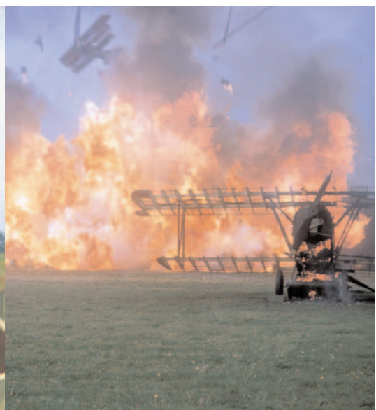
Darling Lily 1968 : Fireworks in Weston