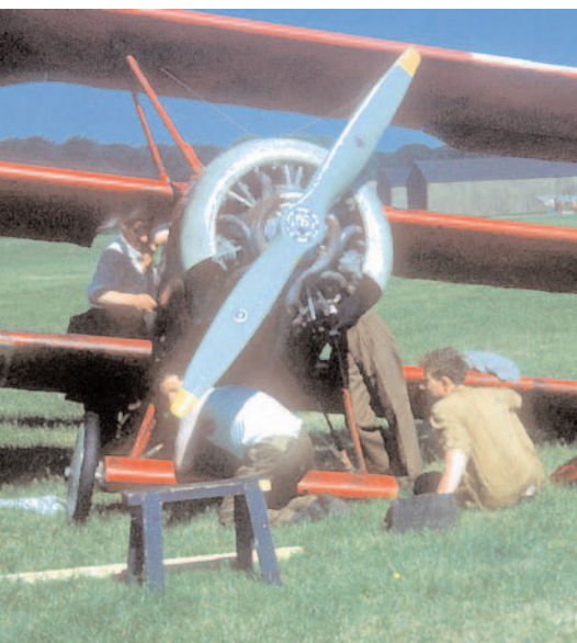
Darling Lily 1968: Landing incident in Weston