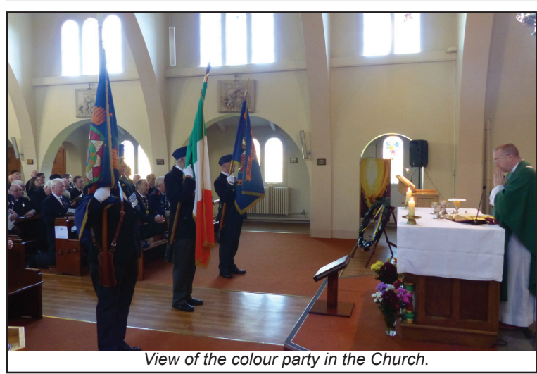
View of the colour party in the Church.