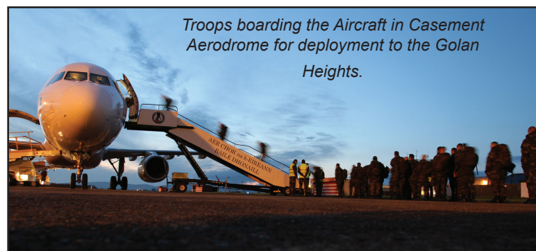
Troops boarding the Aircraft in Casement Aerodrome for deployment to the Golan Heights.

A Casa CN235 recently completed the 100th Air Ambulance mission of 2014.