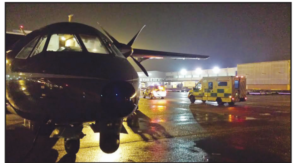
Casa Ambulance Mission:

extends 200 nautical miles from the baselines from which the breadth of the territorial sea is measured. Currently the island of Ireland itself covers 20,863,360 acres of land and over 220 million acres of marine and undersea territory. This marine environment is a fantastically valuable resource and, by using the Air Corps, Ireland's Territorial sea and EEZ will increase, as will the State's rights over the exploration and use of marine resources of this area.