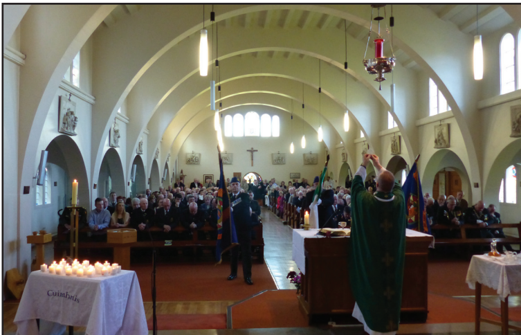
View of the Church and congregation during the Consecration