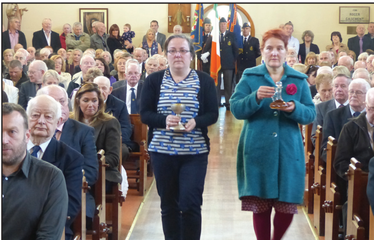
Presentation of gifts by family members of the deceased.