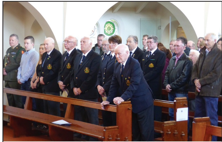
View of the congregation.