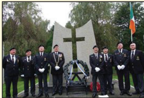
The Branch was very pleased to welcome visitors from other ONET Branches to the ceremony.