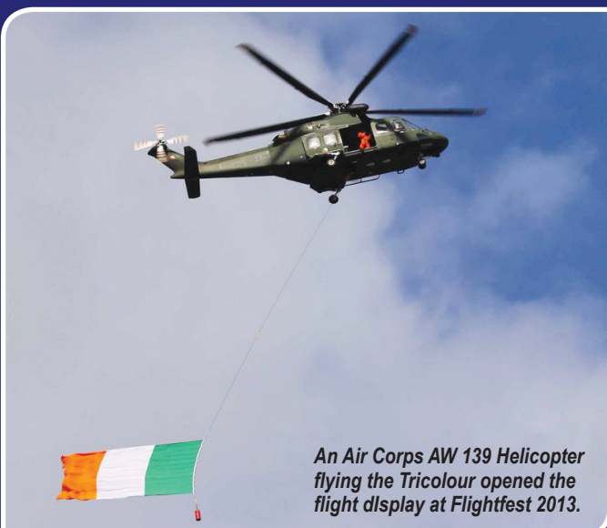
An Air Corps AW 139 Helicopter flying the Tricolour opened the flight display at Flightfest 2013.

Formations from Wolf Section (helicopter), Eagle Section (PC-9) and Neptune Section (CASA) battled the turbulent conditions to put on a great display and showed the Nation the professionalism of the Air Corps."