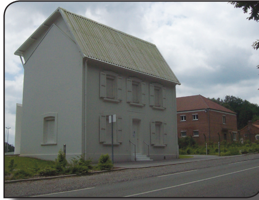
The forester's house in Ors where Wilfred Owen spent his last night, has been transformed into an art installation and permanent memorial to Owen and his poetry, which opened to the public on 1 October 2011.