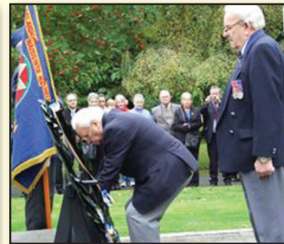
A wreath was laid by members of the RAF Association