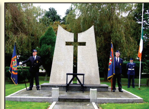
All ready for the wreath laying ceremony