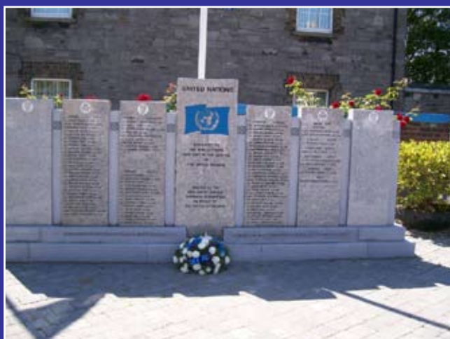
UN Veterans Memorial, Arbour Hill