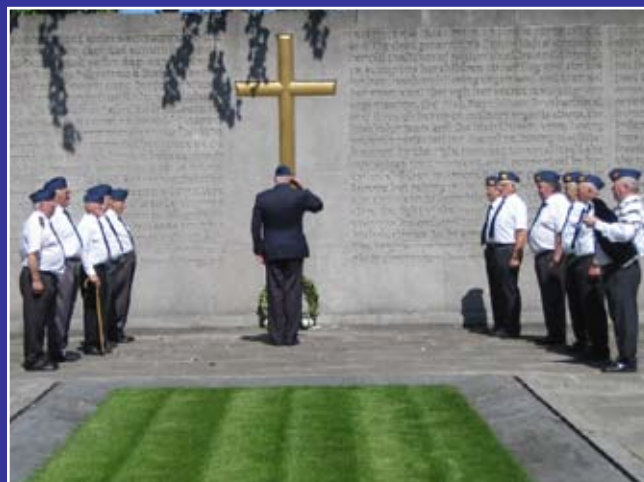
Wreath Laying Ceremony