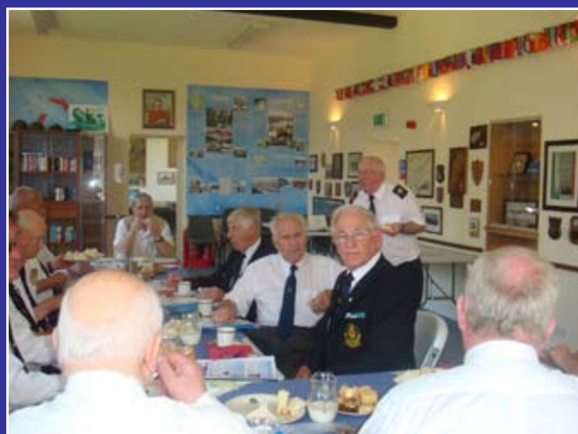
Enjoying a cup of tea in Arbour Hill House