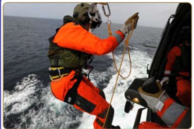
301 Squadron of No. 3 Operations Wing operate a fleet of 6 AW139, medium lift helicopters, routinely conduct winch and casualty evacuation training with the Naval Service, off the South coast of Cork.