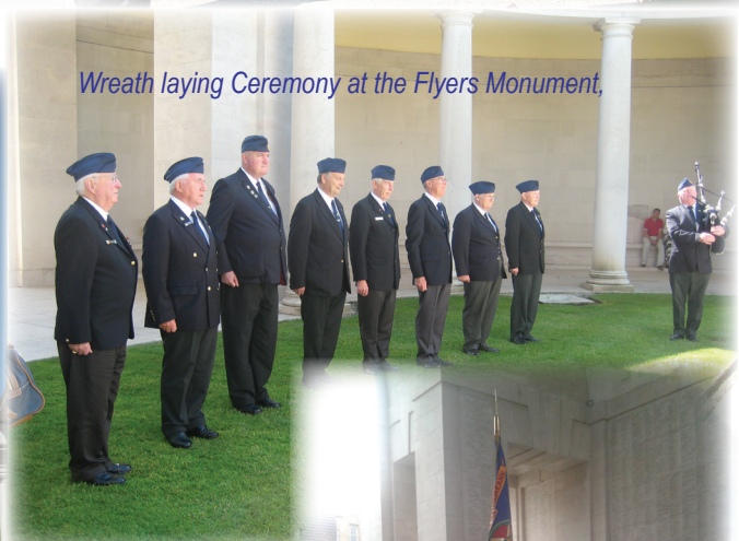
Wreath laying Ceremony at the Flyers Monument,