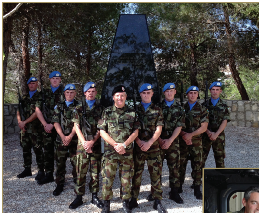
GOC visits Air Corps troops in Lebanon

The results from these aviation enthusiasts were absolutely amazing and really show the Air Corps in a different light. Check out the Official Air Corps face Book page to see the photographs from the night.