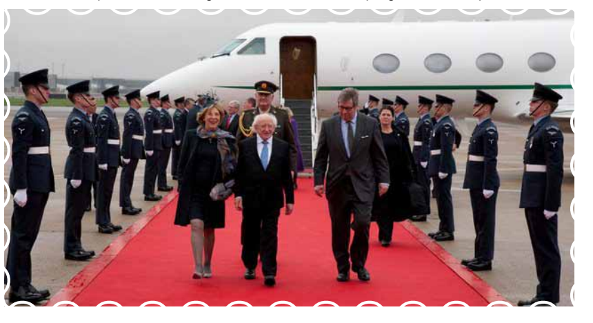
President Higgins arrives in the UK on an IAC Gulfstream Aircraft

Over the following two hours, 'AW 279' winched casualties off to safety while 'Charlie 252' provided a communications platform for the exercise and kept the different agencies informed of the progress of the operation.