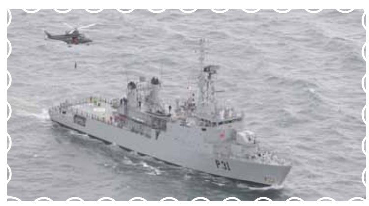
An Air Corps AW 139 approaches the stern of the L.E Eithne to carry out a winching exercise.