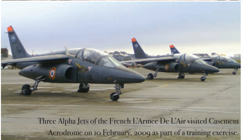
Three Alpha Jets of the French L'Armée De L'Air visited Casement Aerodrome on 10 February, 2009 as part of a training exercise.