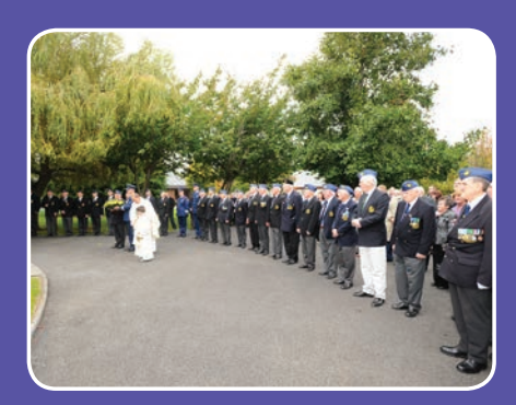
Guard of Honour prepares for Wreath Laying Ceremony