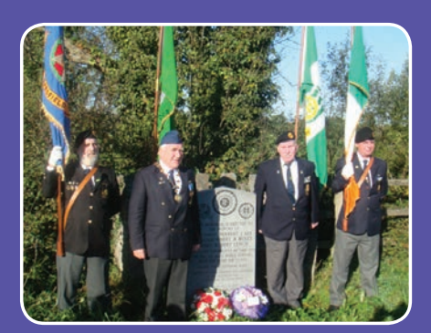
Wreath Laying at the monument outside Limerick for the Air Corps personnel killed in road accident in 1940. Branch Chairman with members of the Patrick Sarsfield Branch.