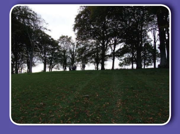
General view of the accident site.