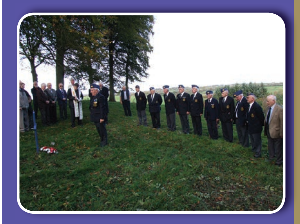
Branch Chairman lays a wreath at the crash site with members of the Branch forming a Guard of Honour.

Air Corps DH DOVE Aircraft188 flew to Shannon on the afternoon of 23 Jan 1961 and the next day commenced training with two flights each morning for the next four days. The aircraft was engaged in flying duties in support of the Department of Transport & Power Air Traffic Control Service.