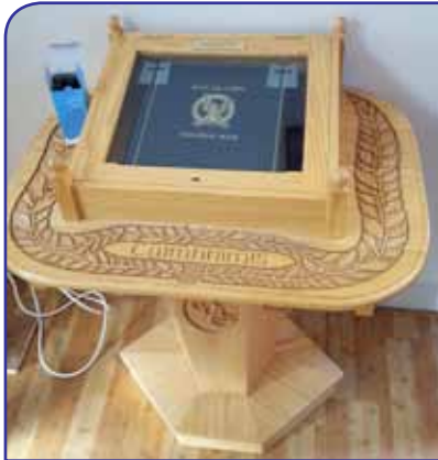
The Glass case containing the Memorial Book is located at the rear of the Church in Casement Aerodrome.

Visitors are able to view the details of names entered in the book from an index file which is kept updated with the names in alphabetical order and located in the adjacent drawer.