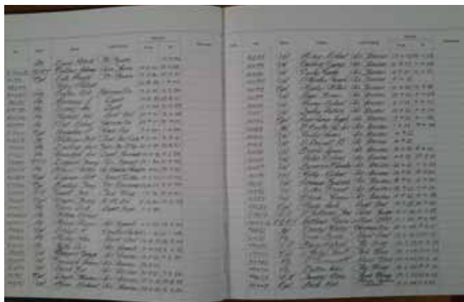
Names of the deceased are inscribed annually by a Lithographer.

This Memorial Book presented by The Roger Casement Branch O.N.E. has inscribed within the names of the deceased members who served the Air Corps Cuiusvis